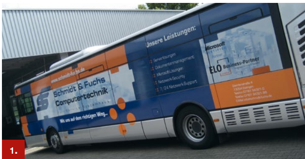
Example 1 ORACAL® 952 / 953

The ORACAL® 552 series of light-fast and weather resistant material, is designed for long-lasting high quality vehicle decorations. It comes in white and transparent with glossy surface. The permanent seawater resistant high performance acrylic adhesive meets all the highest requirements. Possible applications are high quality screen printing for outdoor lettering, decorations and marking of products with high demands on resistance and durability.