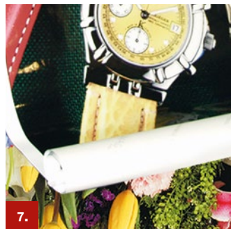
Example 7 ORACAL® 1610