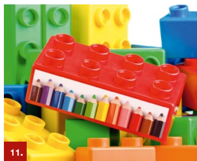
Example 12 ORACAL® 1740/1720