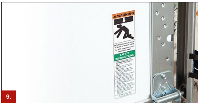
Example 10 ORACAL® 620

These health friendly, very soft PVC films are suited for short and medium term outdoor applications such as markings, inscriptions and decorations. Indoor exposure is almost unlimited. The films fulfil the requirements of the European directives 2005/84/EC (phthalates in toys and child care articles). Series 640PF is equipped with a permanent, series 620PF with a removable adhesive.