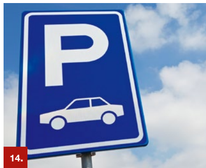
Example 15 ORALITE® 5500