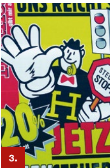
Example 3 ORACAL® 1670

These films have been developed for high quality screen printing, UV-offset and flexoprinting. In cases where a high degree of humidity may affect the bonding of the material, ORACAL® 1650 series is the perfect choice with its water-resistant high performance acrylic adhesive. ORACAL® 1630 is recommended for applications where the film needs to be removed without residue even after a two-year bonding period. Both films are suited for short and medium-term exterior use: for markings, inscriptions and decorations.