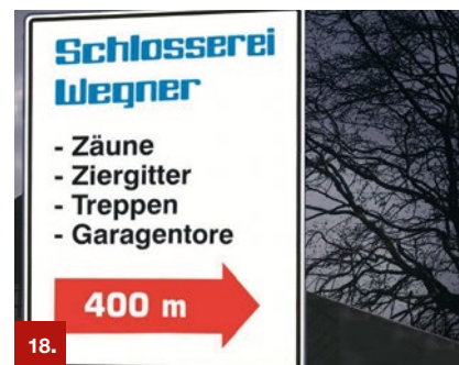
Example 19 ORALITE® 5200