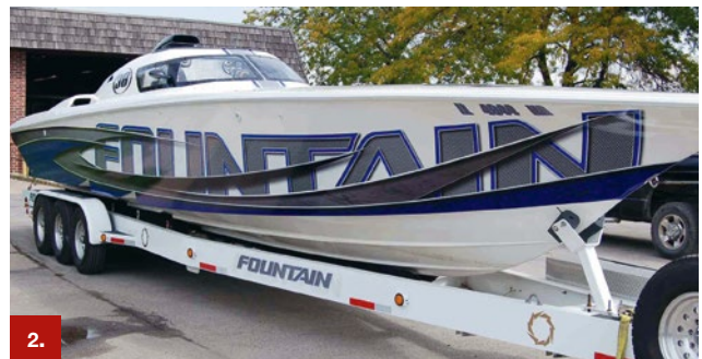
Example 2 ORACAL® 1050