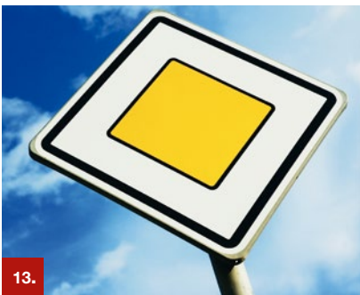
Example 14 ORALITE® 5700

Both ORALITE® reflective films series 5600E and 5600 have been designed for high quality graphics. The materials can be digitally printed. Both films are suitable for use on cutting plotters, and provide good adaptability also to corrugations and rivets. ORALITE® 5600E is approved to ECE104, and may be applied as graphics inside contour markings on the sides of HGVs. The material is available in 11 colours, and comes with a high degree of flexibility as well as excellent corrosion and solvent resistance. ORALITE® 5650RA is particularly suited for large-sized graphics or decals as the RapidAir ® technology enables easy and rapid application without air inclusion onto even or slightly curved surfaces.