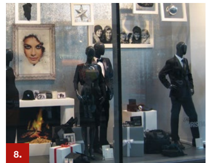
Example 8 ORACAL® 1640HT