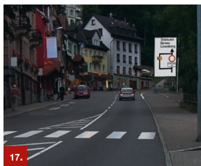
Example 18 ORALITE® 5300