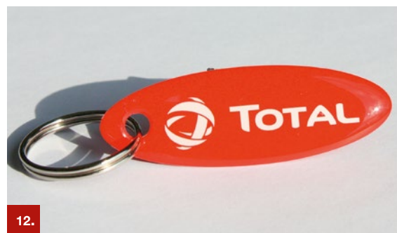
Example 13 ORACAL® 301F