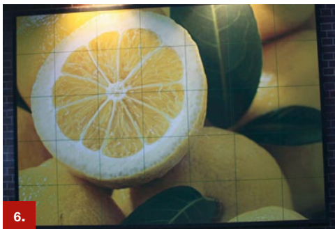
Example 6 ORACAL® 1640

For ORAFOL® Floor Graphics systems in connection with ORAGUARD® 250AS or 255AS. Excellent opacity suppressing colour shadows of the floor surface. The adhesive guarantees clean removal.