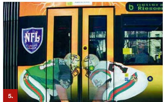
Example 5 ORACAL® 1668