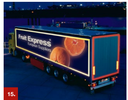
Example 16 ORALITE® 5600E