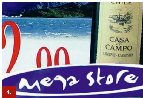
Example 4 ORACAL® 1650