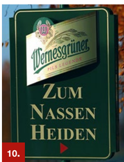
Example 11 ORACAL® 352

The ECO PRINT line represents an alternative to PVC films for use in screen and offset printing. These polyolefin films come in transparent and white and have a glossy surface treated for an improved printability. The permanent adhesive of 1740 series and the removable acrylic adhesive of 1720 make these special PVC-free films ideal for a wide range of applications, where PVC-free material is strongly required.